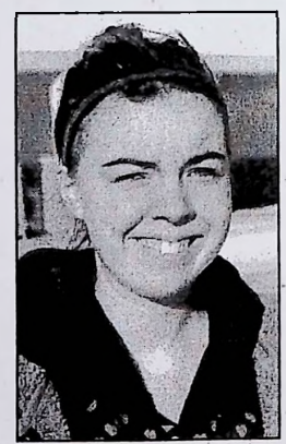
"It scares me to be out and about in town anymore."