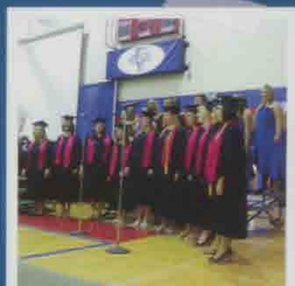
Our last hurrah.

The Choir Seniors accompanied by the Crimson State Show Choir.